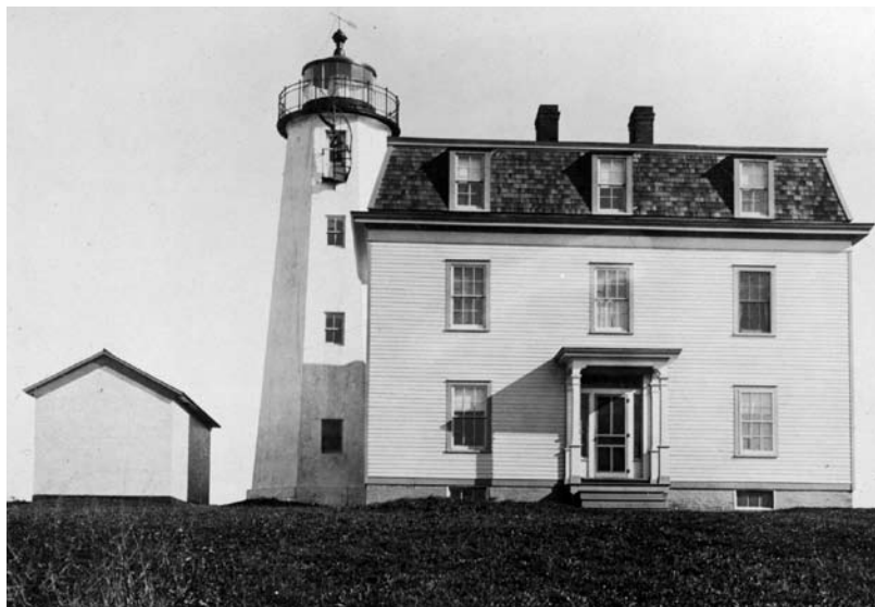
The Minzners photographed their island home showing the three-story dwelling, the light tower, and paint supply shed, circa, 1930.