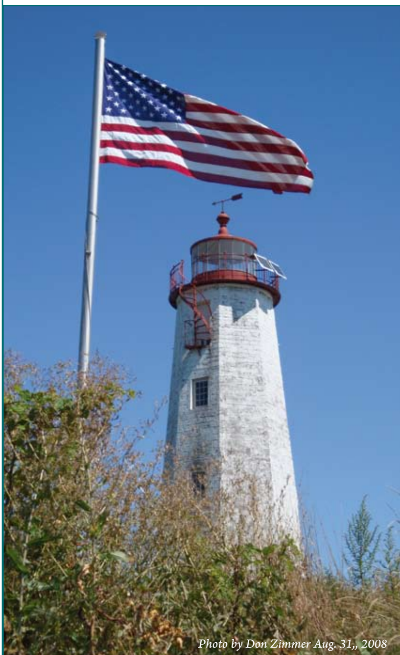
Aug. 31,, 2008

Newsletter of the Faulkner's Light Brigade Spring 2009